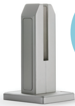
PL200 STUB POST